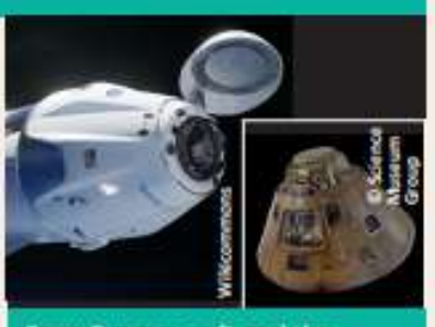
Crew Dragon craft and the Apollo command module (inset)

first travelled to the moon in an Apollo command module, but the new Crew Dragon spacecraft (right) looks surprisingly similar to those used more than 50 years ago.