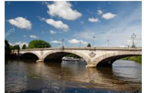
the river and Kew Bridge