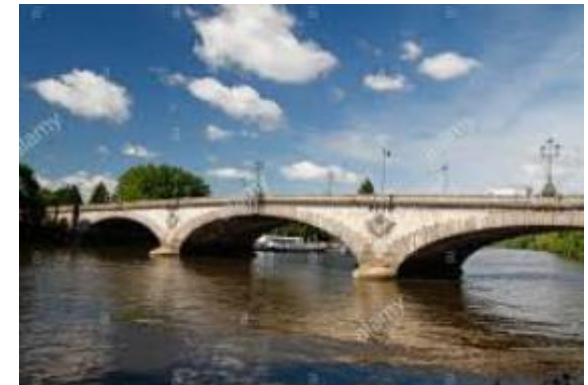
the river and Kew Bridge

What else might you be able to see? Can she see anyone she knows?