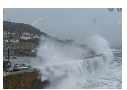
A rough storm