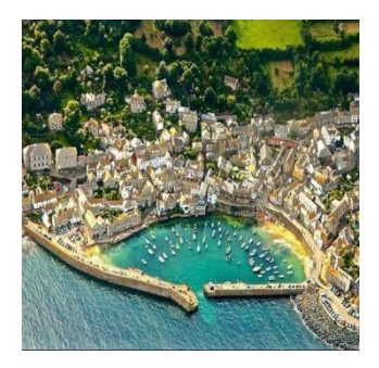
Mousehole fishing village.