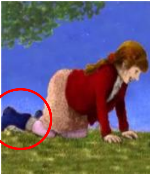
Wellington (Welly boot)

3. If you would like to try, or have an adult to help you, please read the rest of the text below