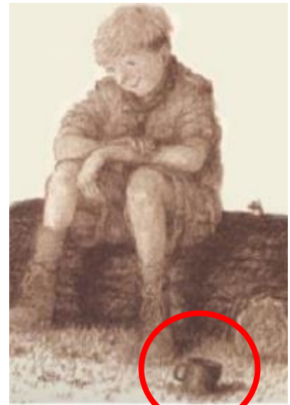
Cocoa (Hot chocolate)

In your books, draw and label a picture to show the meaning of these words :