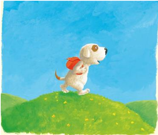
When Sid set off for school one day,

https://www.booktrust.org.uk/books-and-reading/have-some-fun/storybooks-and-games/some-dogs-do/