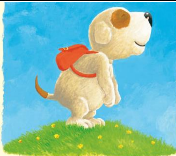
a happy feeling came his way.