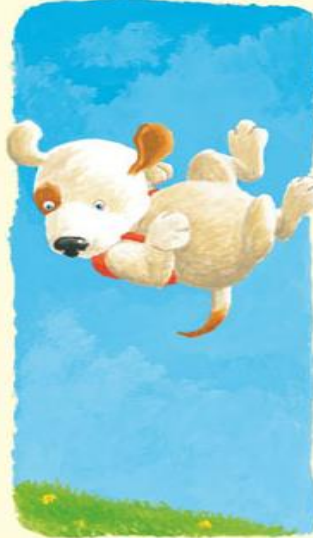
Without a how, without a why,