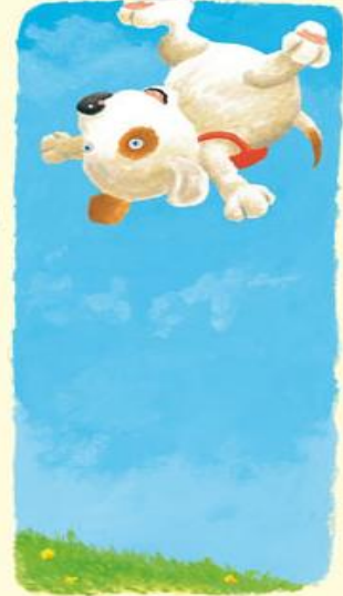
Sid fell up towards the sky.