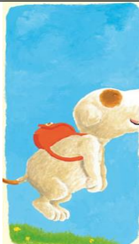
It filled him up so much he found