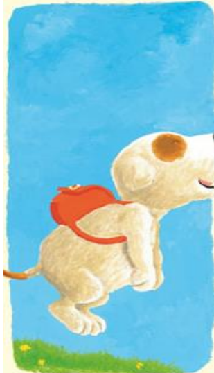
It filled him up so much he found