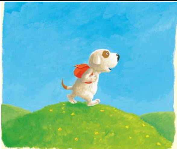
When Sid set off for school one day,

2. Answer the questions using information that you have found in the text