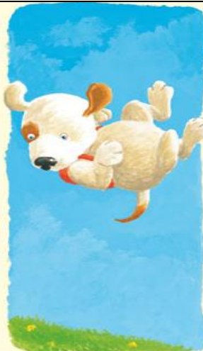
Without a how, without a why,