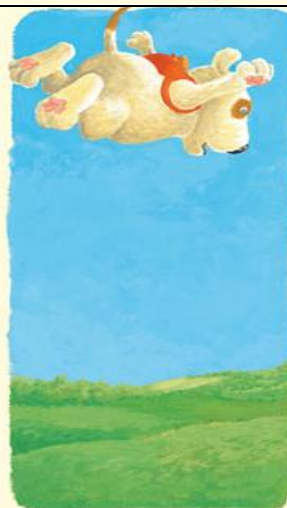
in the land of sun and moon,