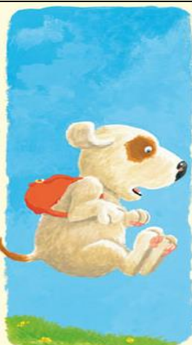
his paws just lifted off the ground.