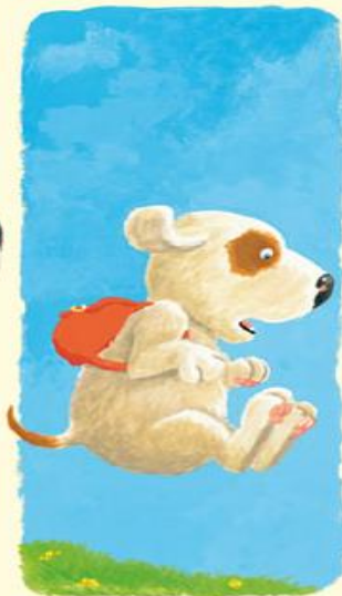
his paws just lifted off the ground.