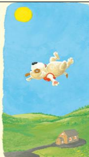
like a doggy-shaped balloon.