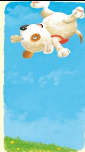
Sid fell up towards the sky.