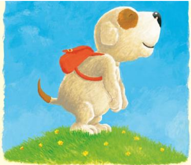
a happy feeling came his way.