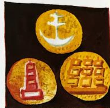
Iced Sea Biscuits