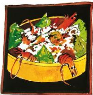
A Mixed Seafood Salad