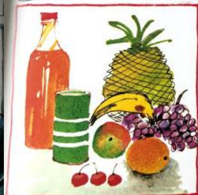
Drinks and Assorted Fruit