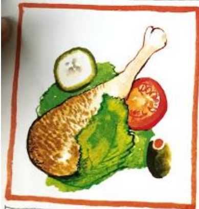
Cold Chicken Garnish