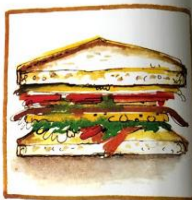
A Lighthouse Sandwich