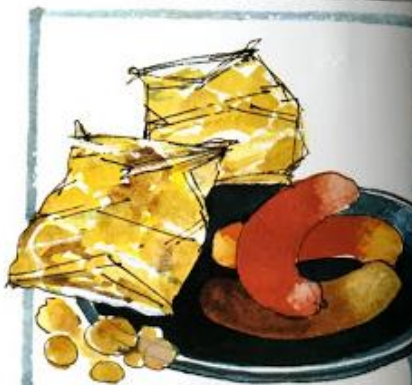
Sausages and Crisps