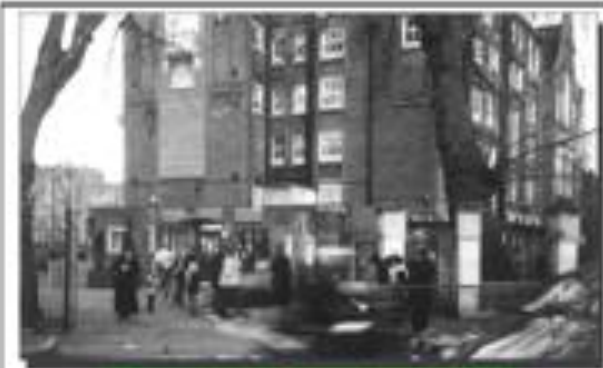
Canonbury School in 2003

There is a nursery, two reception classes and an infant and junior school. Read on to find out more!