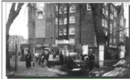
Canonbury School in 2003

Canonbury is a primary school on Canonbury Road in North London. There is a nursery, two reception classes and an infant and junior school. Read on to find out more!