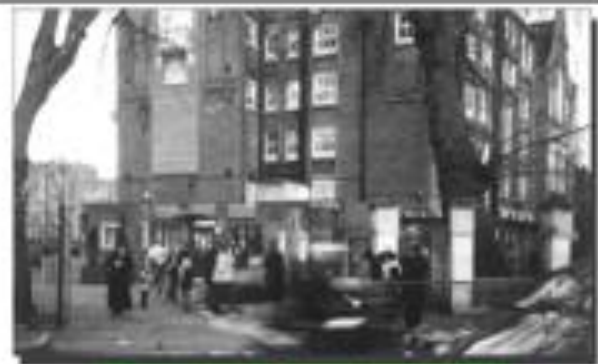
Canonbury School in 2003

There is a nursery, two reception classes and an infant and junior school. Read on to find out more!