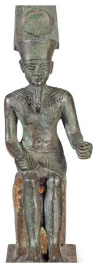
Amun-Ra was the leader of the Ancient Egyptian gods.