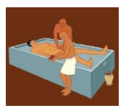
Dry body out in salt.