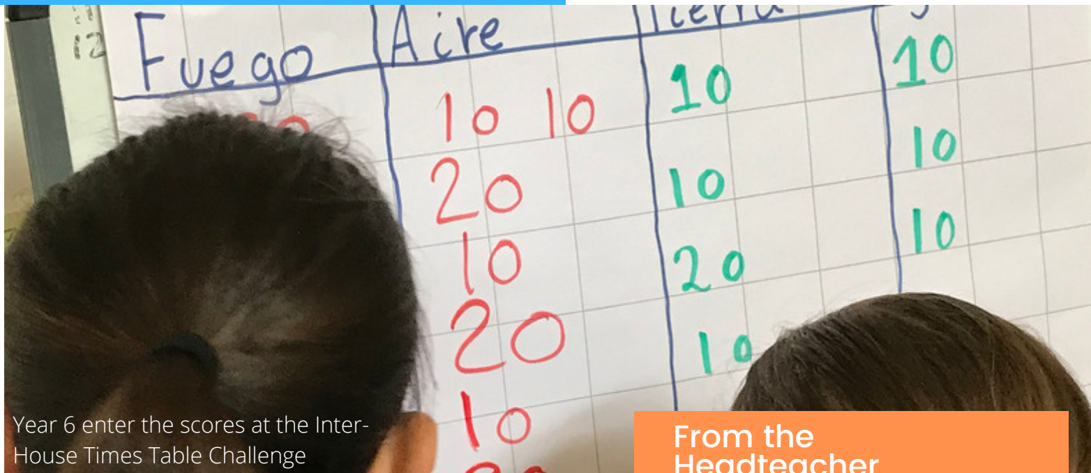
Year 6 enter the scores at the Inter-House Times Table Challenge