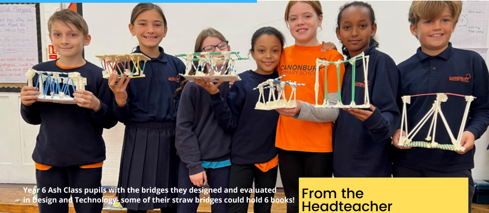
Year 6 Ash Class pupils with the bridges they designed and evaluated in Design and Technology- some of their straw bridges could hold 6 books!