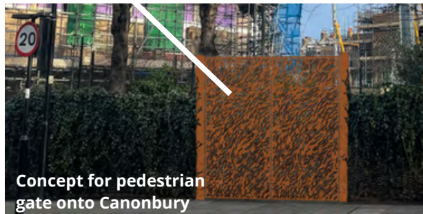
Concept for pedestrian gate onto Canonbury