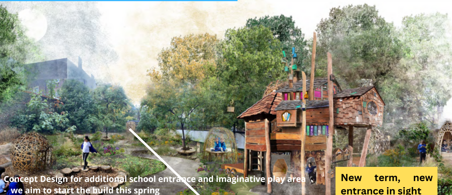
Concept Design for additional school entrance and imaginative play area - we aim to start the build this spring