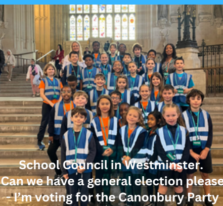
School Council in Westminster.

Can we have a general election please - I'm voting for the Canonbury Party