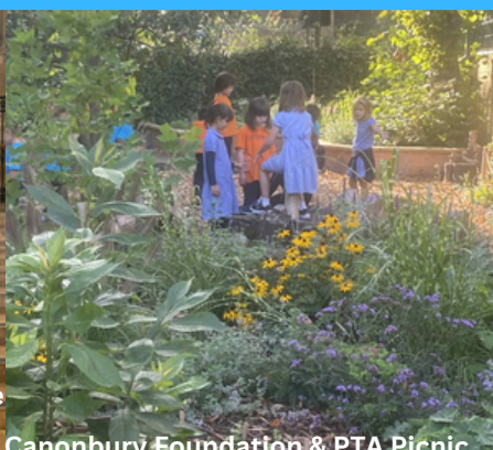
Canonbury Foundation & PTA Picnic

Can we have a general election please - I'm voting for the Canonbury Party