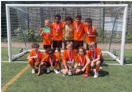
League and Cup Champions 2025