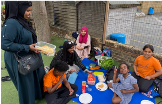
Eid Celebration Tea