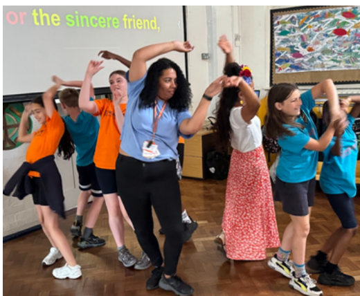
Hispanic Day Dance