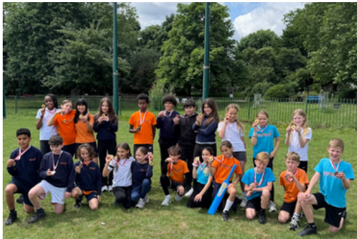
Girls and Boys Cricket Teams