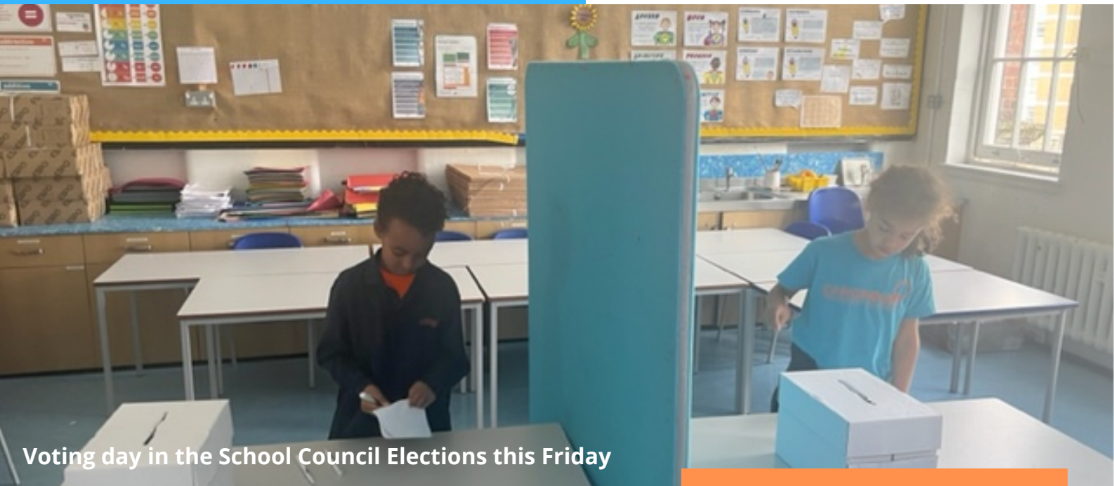
Voting day in the School Council Elections this Friday