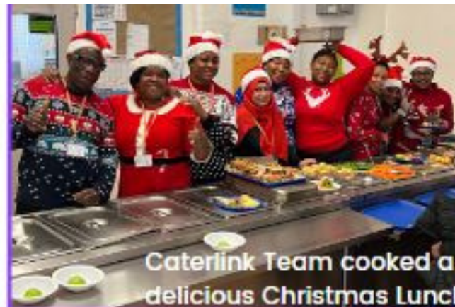
Caterlink Team cooked a delicious Christmas Lunch