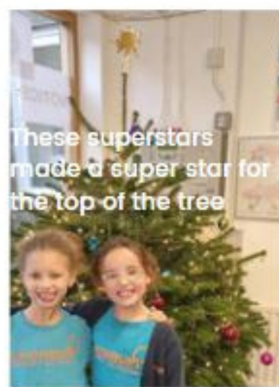
These superstars made a super star for the top of the tree