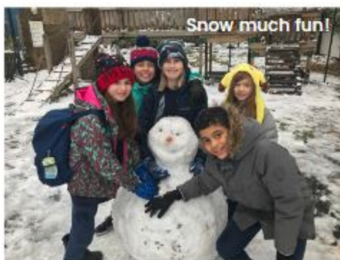
Snow much fun!