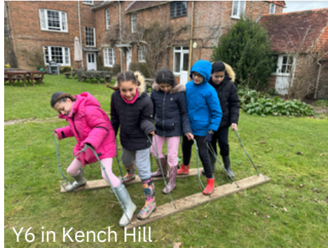
Y6 in Kench Hill