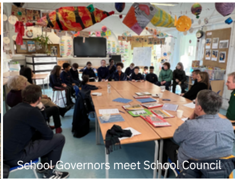
School Governors meet School Council