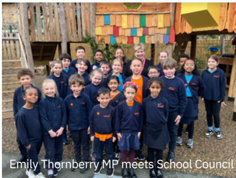
Emily Thornberry MP meets School Council