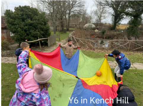
Y6 in Kench Hill