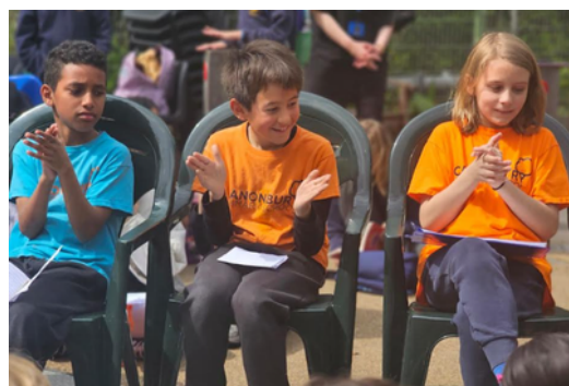
Listening to the opposition