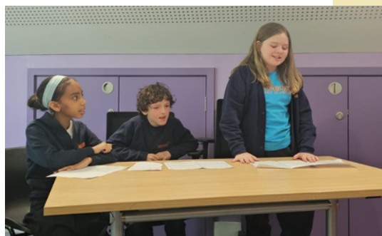
Debate in progress