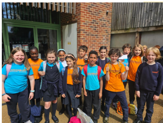
Year 5 Debate Team 2025