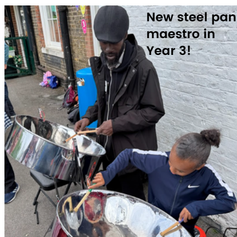
New steel pan maestro in Year 3!