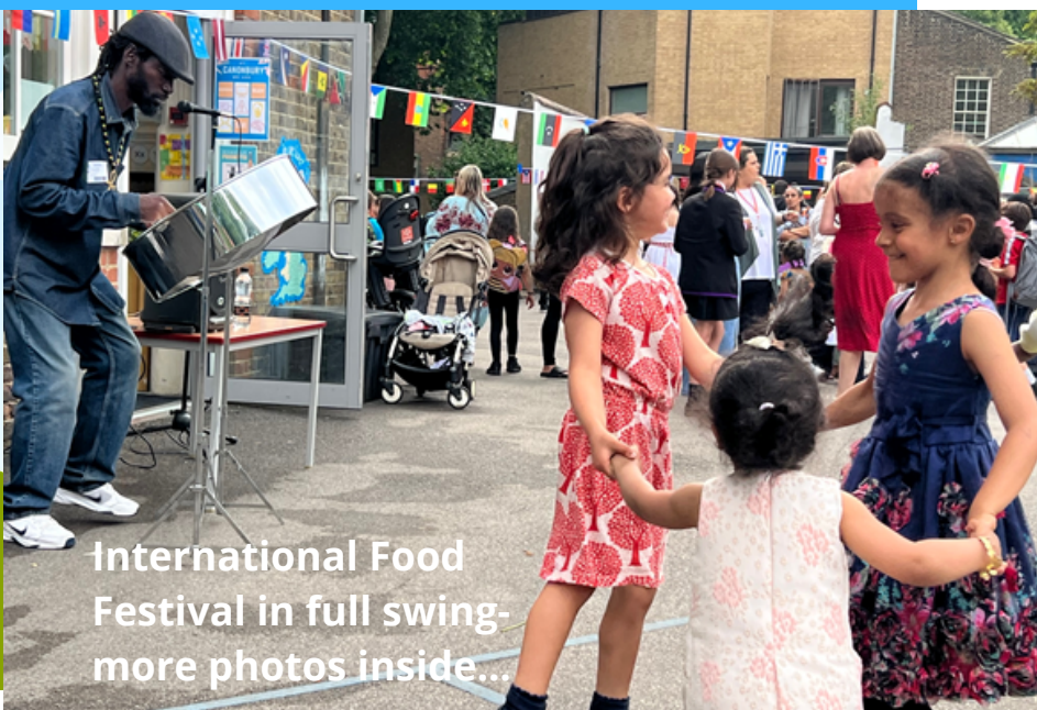
International Food Festival in full swing- more photos inside...