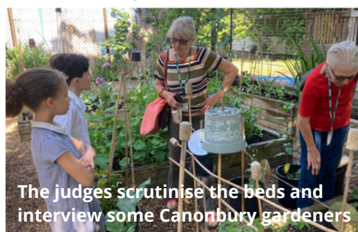
The judges scrutinise the beds and interview some Canonbury gardeners

This week two eminent judges from the London Children's Flower Society visited us to judge our garden - and we won Gold! Our gardener representatives did a fantastic job speaking to the judges.