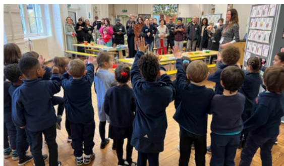
Y1 Chestnut sing to parents in their workshop