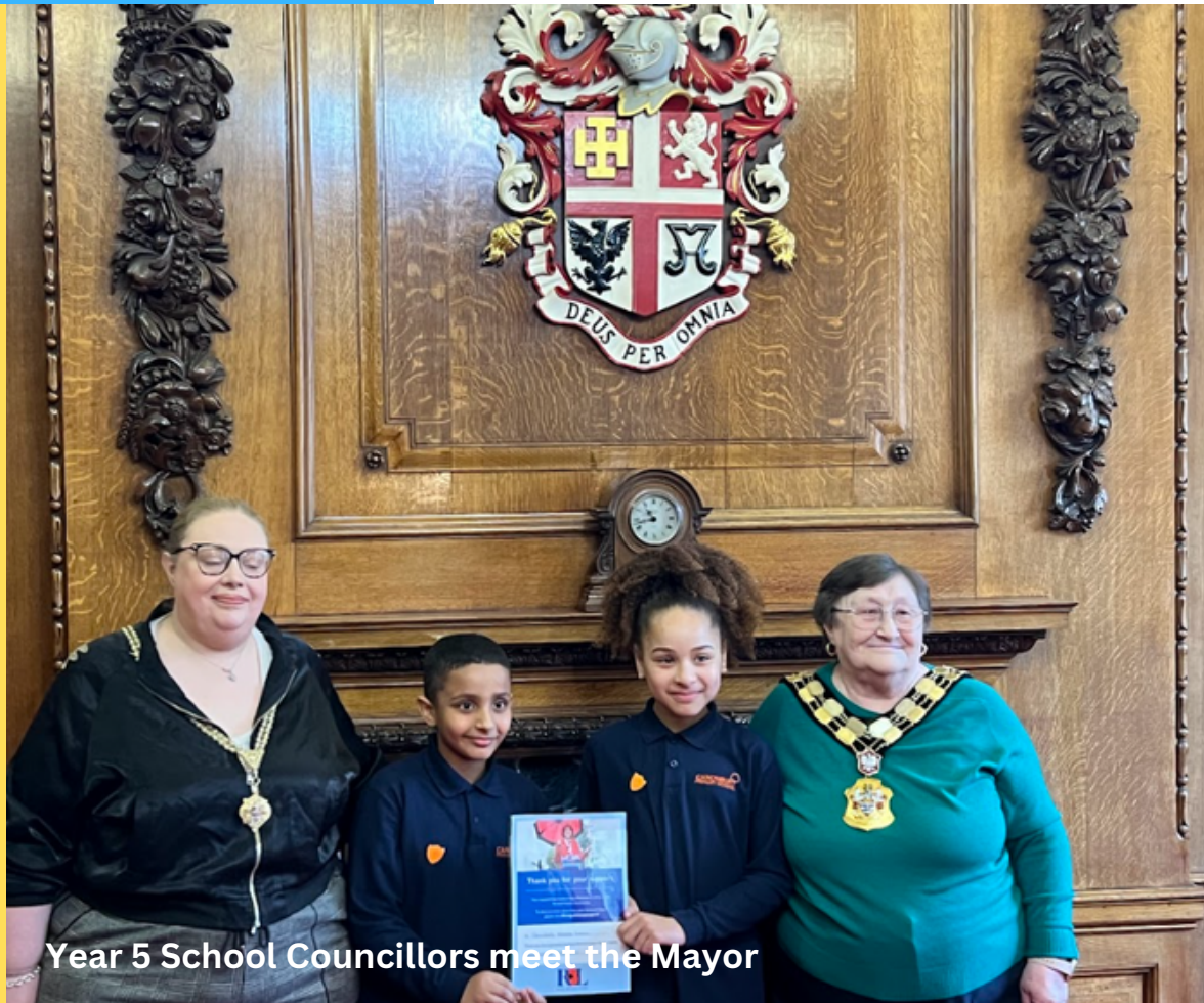
Year 5 School Councillors meet the Mayor

House Captains hosting the Times Table Challenge - more pics and points table on page 3!