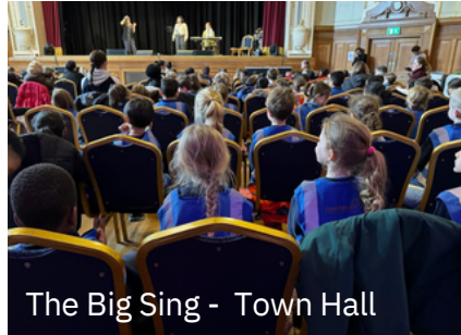
The Big Sing - Town Hall