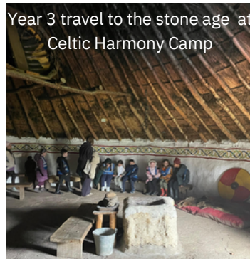
Year 3 travel to the stone age at Celtic Harmony Camp