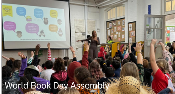
World Book Day Assembly