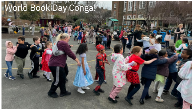
World Book Day Conga!