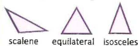
scalene equilateral isosceles