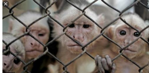
cage of monkeys